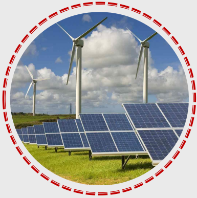
Energy & Power